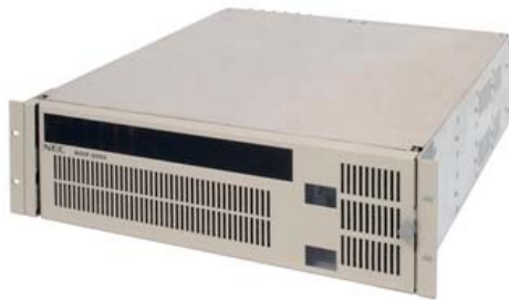
MF730/opt common frame for optical / converter board

The VSP-X1000 ACO4 is an automatic changeover board equipped with seamless switching and monitoring function of video, audio and ancillary packets for the max. 4 lines of HD/SD input signals. Changeover control is available based on automatic switching with predefined conditions or manual command. The VSP-X1000 ACO4 has two outputs, PGM OUT for the main line and PVW OUT for monitoring.